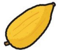
Etrog (citrus) אתרוג