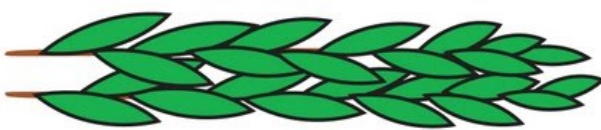
Arava (willow) ארבה