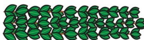
Hadas (myrtle) הדס