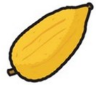
Etrog (citrus) אתרוג